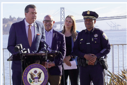
▲ Rep. Kevin Mullin introduces the Earthquake Resilience Act on the anniversary of Loma Prieta.