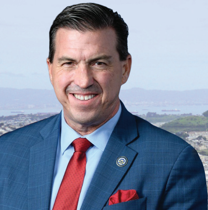
Congressman Kevin Mullin